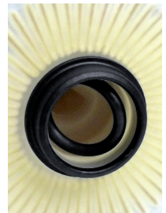
Figure 4: gasket stuck in the filter gasket