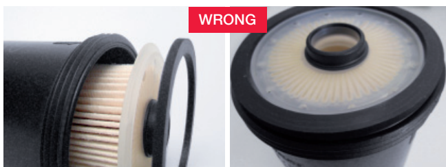
Figure 1: wrong order

Our tip: with every filter change, please ensure that the sealing ring is correctly seated on the housing cover!