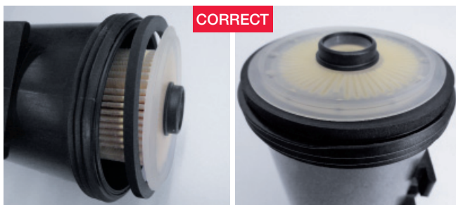
Figure 2: correct order